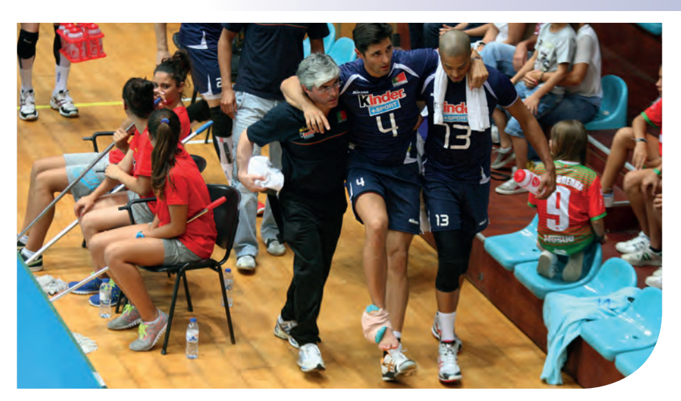
The FIVB's Medical and Anti-Doping programme focuses on prevention through education, ways to keep the sport of volleyball clean and the protection of athletes and referees' health.

The FIVB's Anti-Doping programme seeks to preserve the spirit of volleyball and beach volleyball while maintaining the ideals of ethics, respect, fair play and honesty as well as the athletes' health.